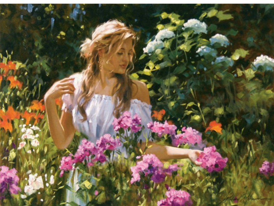
LUXURIANT SEA OF FLOWERS, OIL ON CANVAS, 18 X 24"