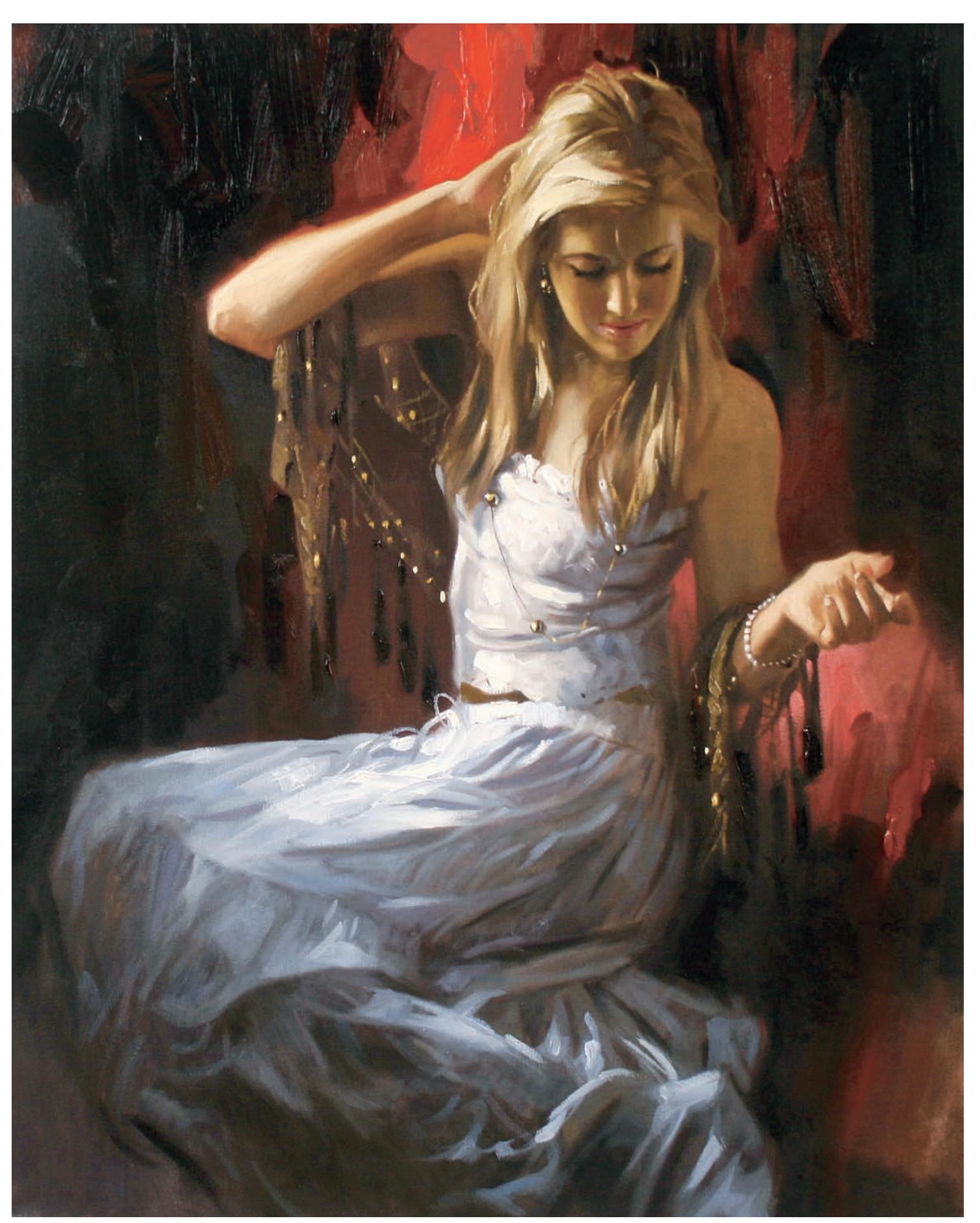
Amber, oil on canvas, 30 x 24 ^{\circ}