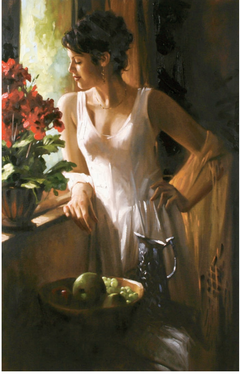
MISTY, OIL ON CANVAS, 36 X 24"